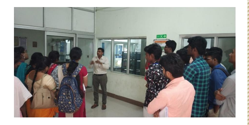
Motivational Speech given by the Scientist to our students.