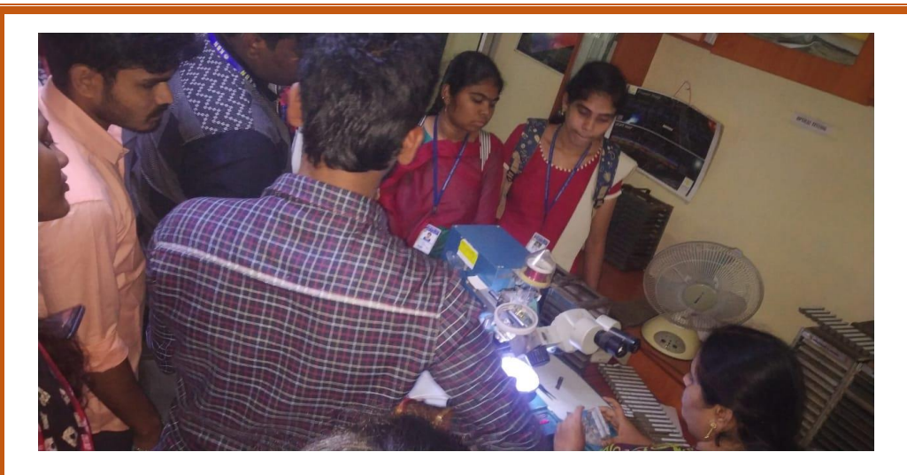
Soldering to LED's in 7-segment display.