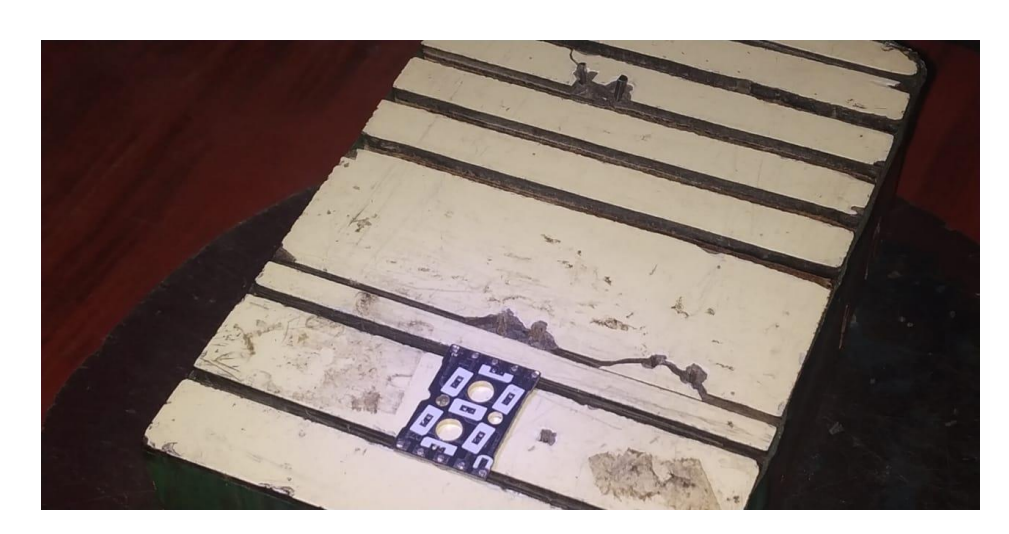
LED Arrangment in 7-segment display.