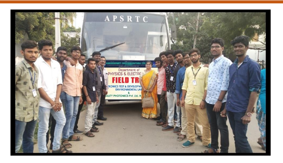
After completing the visit at Kwality Photonics.