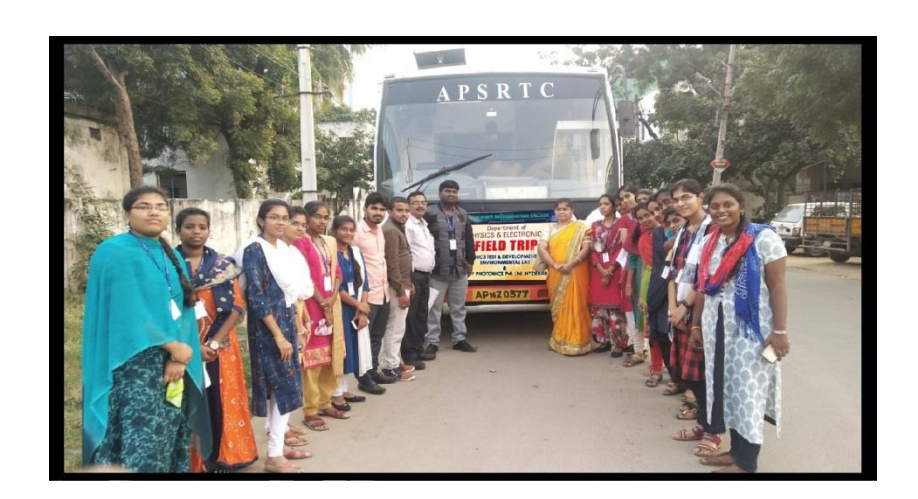
After completing the visit at ETDC.