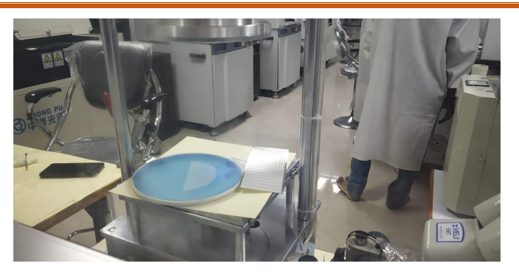
Machine filling LED's in LED Strips.